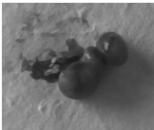
Fig 3 Cold Methanol Extract group