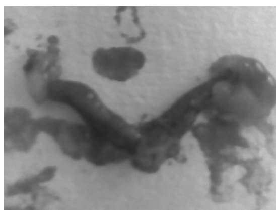
Fig 4 Standard group