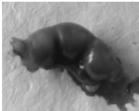
Fig 2 Hot Methanol Extract group